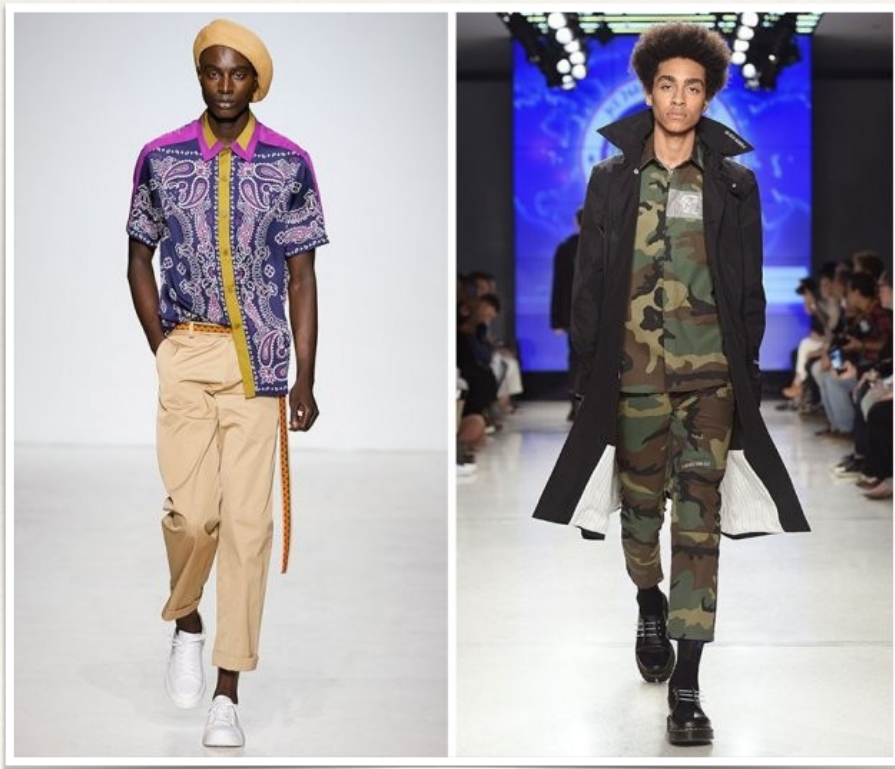
STREET WEAR - MEN'S